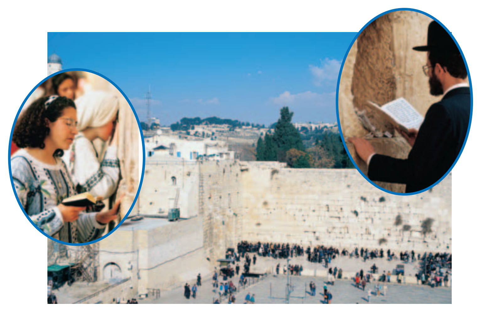
Today Jews come to the Western Wall to pray. What structure is the Western Wall the remains of?

A third group was called Essenes (ih• SEENZ). They were priests who broke away from the Temple in Jerusalem. Many Essenes lived together in the desert. They spent their lives praying and waiting for God to deliver the Jews from the Romans. Like the Sadducees, they followed the written law strictly.